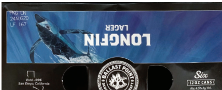
Can 6-packs: Top of carrier Ex: 24AUG2020