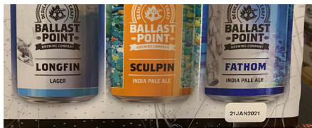
12-pack Can Mix Pack: Date code on side face as shown Ex: 21JAN2021