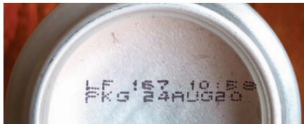
Cans: Bottom of aluminum can Ex: 24AUG2020