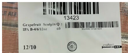
All - Wrapped Pallets: Found on Ballast Point posted sticker Ex: 12/10