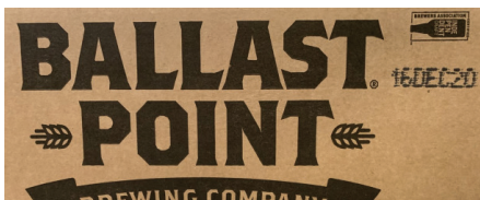
Bottle Cases: Printed on both side panels Ex: 16DEC20