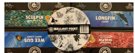
24-pack Can Mix Pack: Date code on each 6-pack Ex: 19JAN21