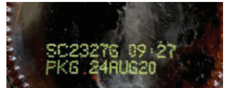
Bottles: Printed on the bottom of the bottle Ex: 24AUG2020