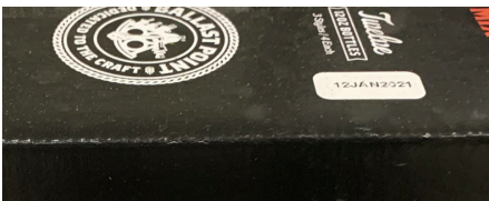
12 Pack Bottle Mixed Packs: Date code on top face Ex: 12JAN2021